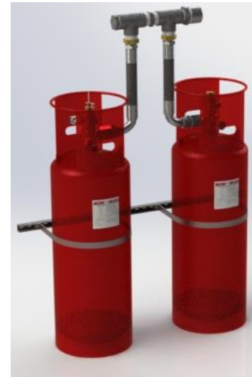
FSL 1230™ 25/42bar Container assembly numbers and technical specifications