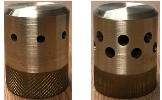
Chemical Nozzle 360 & 180